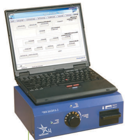
microStar portable reader and associated laptop computer