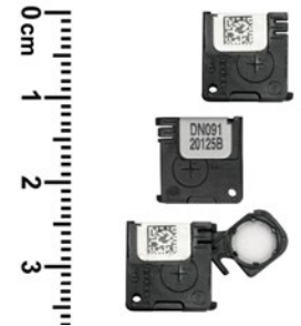
nanoDot Dot for single point measurement