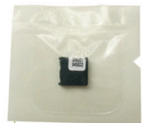
nanoDot in plastic pouch