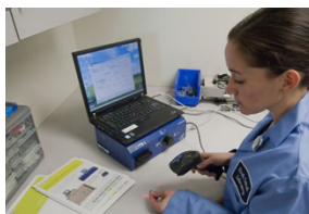
microStar for medical applications