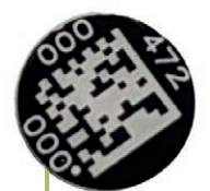
MP7 OSL sensor

The read out process uses a LED (Light Emitting Diode) to stimulate the detectors. The light emitted by the OSL material is measured by a photomultiplier tube (PMT) using a high sensitivity photon counting system. The amount of light released during optical stimulation is directly proportional to the radiation dose.